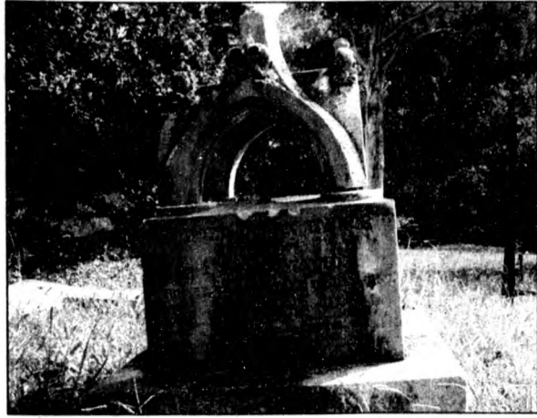
RAKHI DALAL | THE RED & BLACK

The plaque bears a message reading "Today the Old Athens Cemetery, with its beautiful park-like setting, serves as a place of quiet reflection and remembrance of Athens long ago."