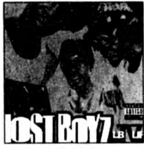
Lost Boyz "LB IV LIFE" Grade: B+