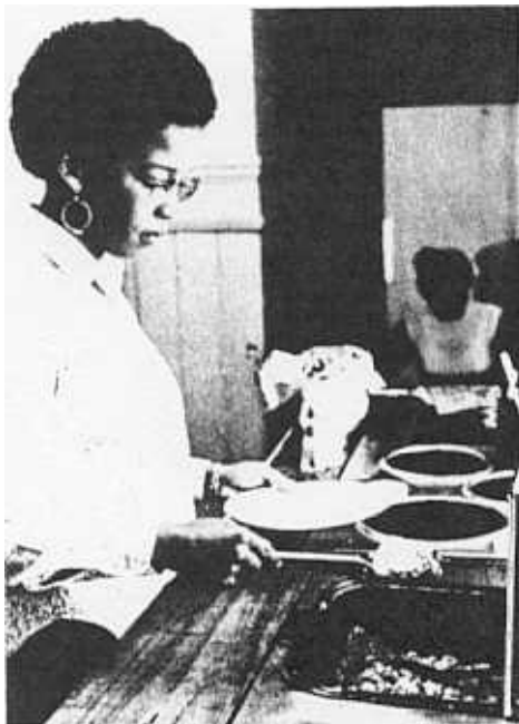
All party work is political